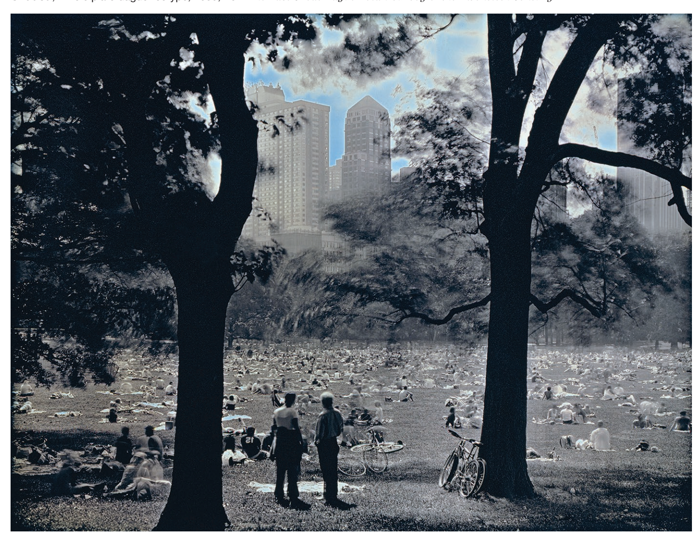
Untitled, Whole plate daguerreotype, 2009, from The Last Great Daguerreian Survey of the Twentieth Century

This element of time-displacement becomes greatly amplified when, as in Spagnoli's case, some of the events depicted in his images have great historic resonance: the inauguration of Barack Obama, most recently, and, most terribly, the destruction of the World Trade Center in 2001. Many photographs of