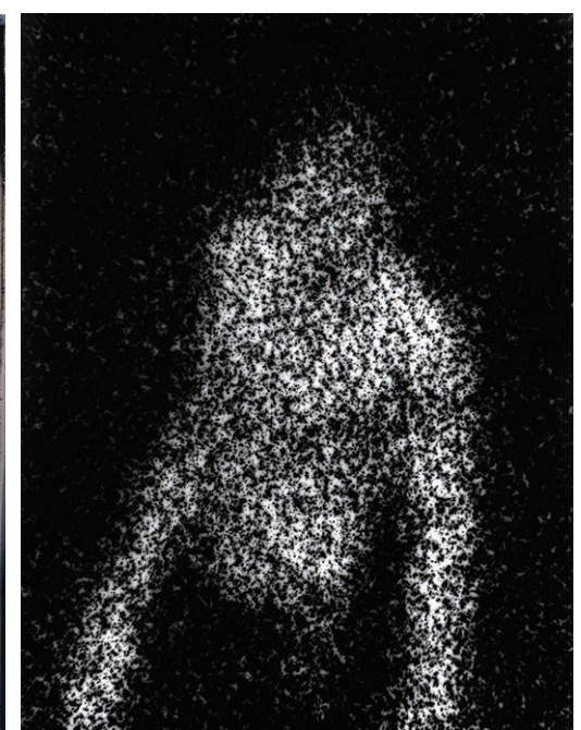
Eikoh Hosoe , Whole plate daguerreotype, 2000