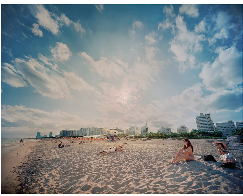
Untitled, Pigment print, 2006, from Local Stories

camera equipped with a 110mm lens to describe deep spaces, the majority of them urban and public but some of them rural and private. A negative this size can register a level of detail far exceeding the capacity of a small-format negative (such as that produced in a 35mm or 2-1/4 camera). For this project Spagnoli uses color film for his negatives, which, in addition to its esthetic consequences, adds a layer of information to the result. And, as a connective thread between the images, he places the sun squarely in the center of each frame, so that we see each scene lit from behind. Thus the sun becomes the only constant in these photographs — the same sun, shining on separate moments and separate vistas all over the world.