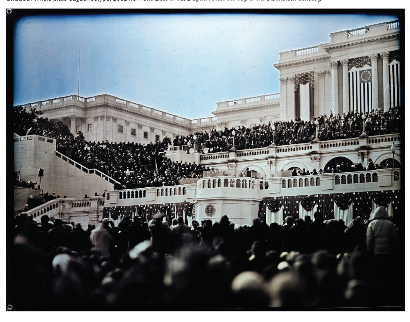
Untitled, Whole plate daguerreotype, 2002 from The Last Great Daguerreian Survey of the Twentieth Century

For several decades these two technologies for the production of photographs coexisted and contended—in Europe, in the Americas and wherever the medium of photography spread. Eventually, however, Talbot's process became preferred to Daguerre's, due not to aesthetic issues but to greater utility. Its creation of a negative enabled the production of multiple prints of any image, and also made possible the enlargement of the original image.